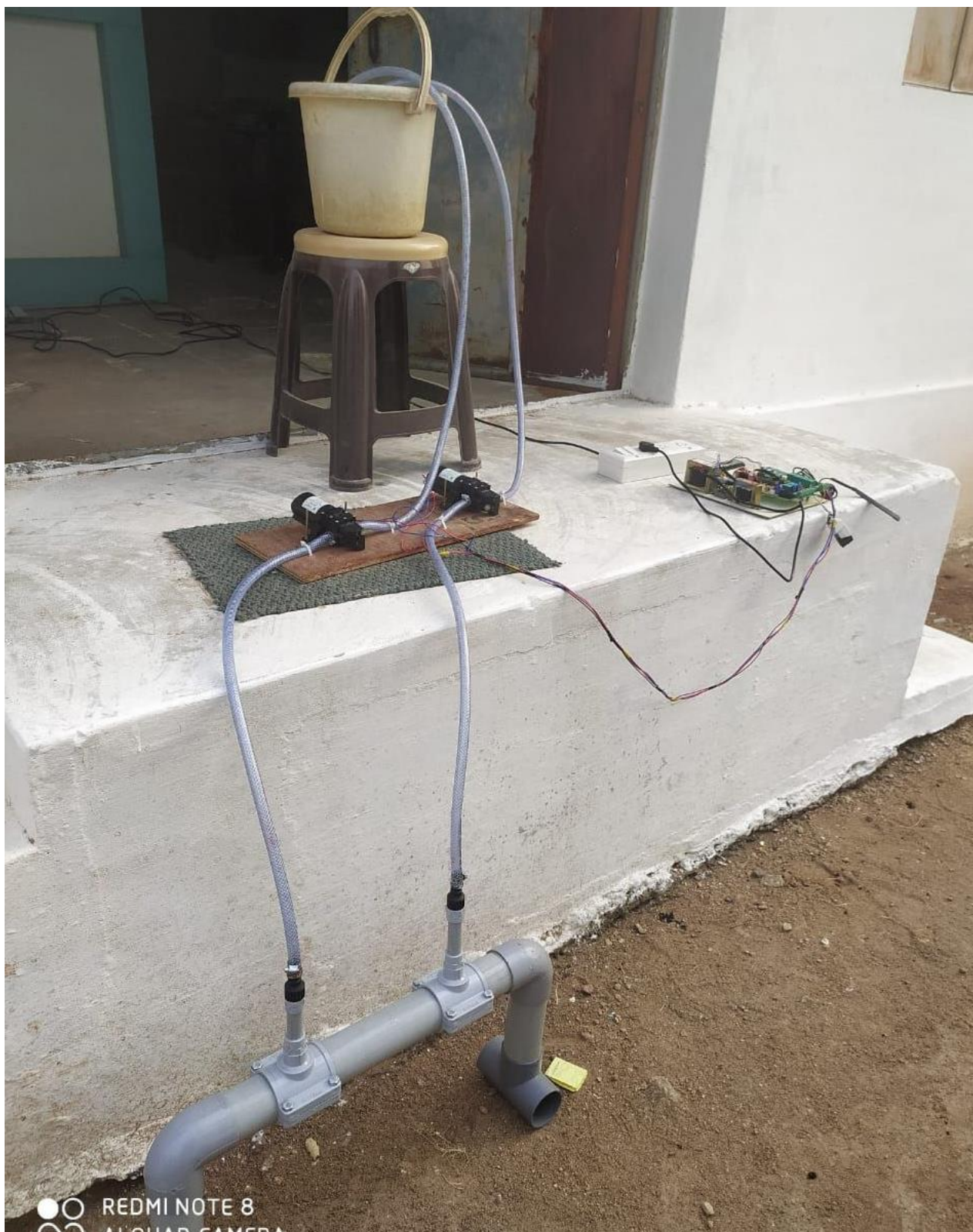
Fig:1.1 experimental setup